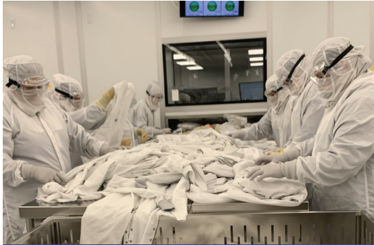
ISO Class 3 - Cleanroom Folding Area