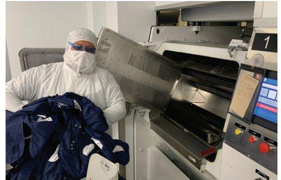
ISO Class 4 - Drying Area