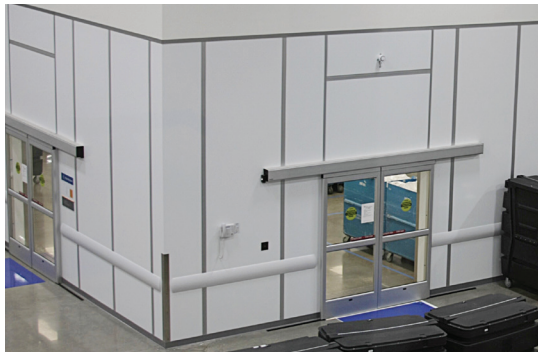
Overview of the distribution and clean staging areas