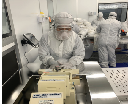
ISO Class 8 - Packaging Area