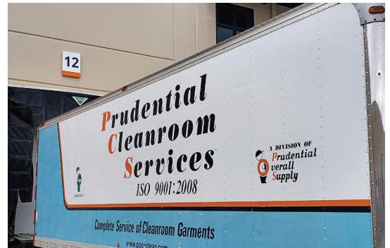
Main CSV dock