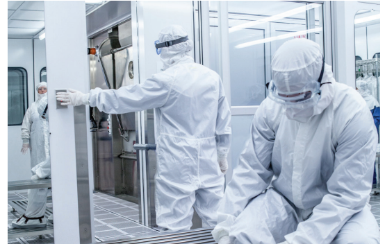
Overview of the distribution and clean staging areas